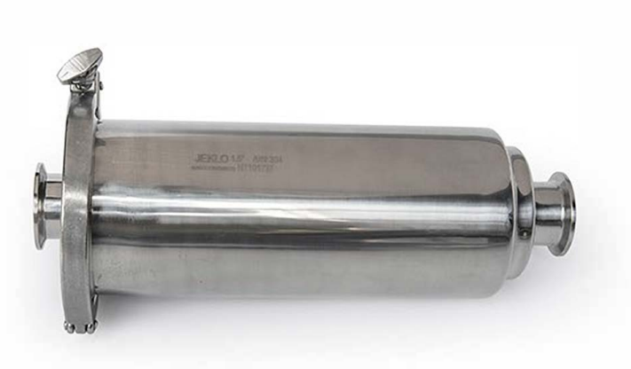
Filter shell with tri-clamp connection 1 1/2"

Cleaning: for correct sanitation of the filter, remove and clean it manually until full elimination of particles in the wedge wire screen. Then, install it in your equipment and use chemical wash.